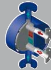
Plate & Shell, Fully Welded