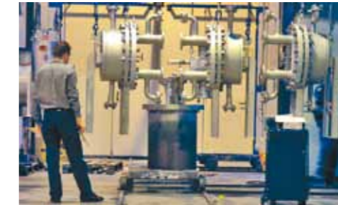
480 kW Raffinate Stripper Bottoms Cooler, PSHE 5HH-148/1/1