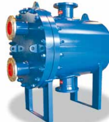
1700 kW Gasoline Cooler in Oil Refinery, PSHE 7HH-354/1/1