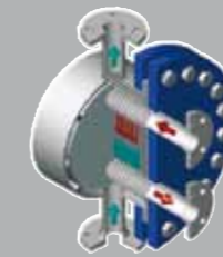
Plate & Shell, Openable