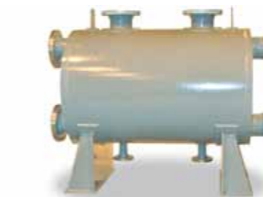
5400 kW Propane Condenser at Polymer Plant, PSHE 9HH-622/1/1