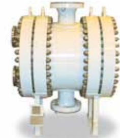
2135 kW 2 nd Stage Suction Cooler (sweet natural gas) operating on a Gas Production Platform, PSHE 7HH-256/1/1 (55 bar design, titanium plates, duplex shell)