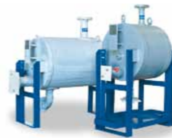
1200 kW Lean/Rich TEG Interchanger and 290 kW Liquid Ring Water Cooler for an Onshore Gas Terminal, PSHE 5HH-276/3/3 and PSHE 5HH-103/3/3