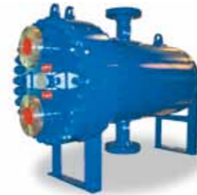
1465 kW Crude Oil Inlet Heater for a Crude Oil Testing Vessel, PSHE 5HH-412/1/1 (91 bar design)