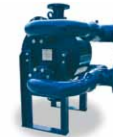
500-1000 kW Multipurpose Cooler, PSHE 5HH-106/1/1