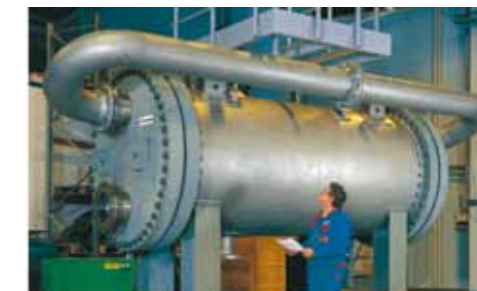
30 MW Effluent Economiser at Ethylene Oxide Plant, PSHE 14HH-968/2/2