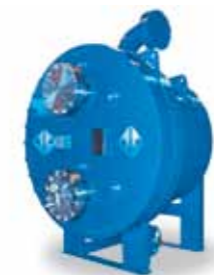
1290 kW LPG Cargo Condenser on LPG Vessel, PSHE 9LL-222/1/1 (titanium plates)