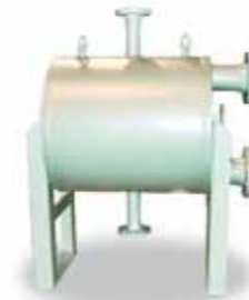
190 kW Lean/Rich TEG Interchanger operating on a Gas Production Platform, PSHE 5HH-220/1/1 (duplex shell)