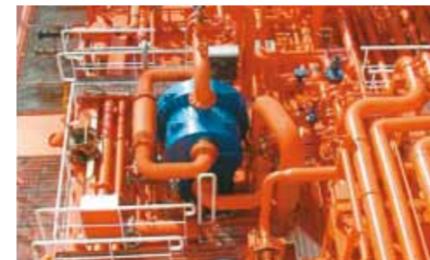
4800 kW LPG Cargo Heater on LPG Vessel, PSHE 9LL-222/1/1 (titanium plates)