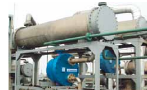
660 kW Benzene Condenser, PSHE 5HH-126/1/1