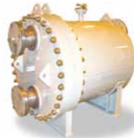
5530 kW Crude Oil Cooler operating on a Production Platform, PSHE 9HH-324/1/1 (titanium plates)