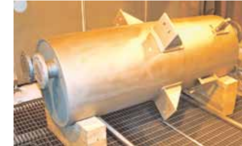
5500 kW Gasoline Partial Evaporator in Oil Refinery, PSHE 5HH-544/4/4