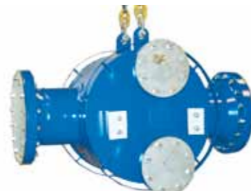
695 kW LNG BOG Heater in a Gas Terminal, PSHE 5LL-124/1/1 (-125 to 200°C Design Temperatures)