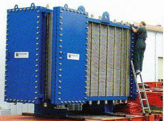
Beer / Stillage Heat Exchanger