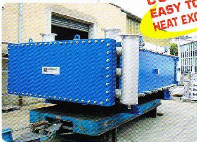
Main Fermenter Cooler